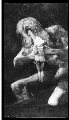
"Saturn Devouring His Son" by Francisco Goya.

One must note the parallels between this and the creation myths of the Greeks and Romans involving Saturn devouring his children. Perhaps this was intentional – modern academia believes, however, that the myth was purposely written in contrast to other religions.